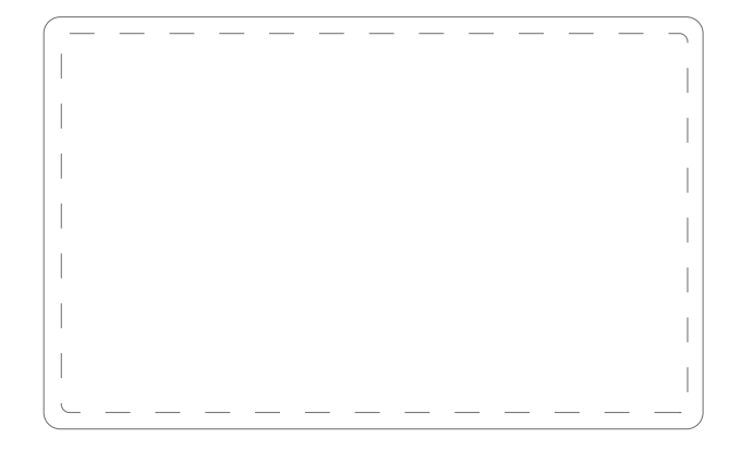
Wooden Badge 80 x 50mm Safety area 2mm Printable surface 76 x 46mm