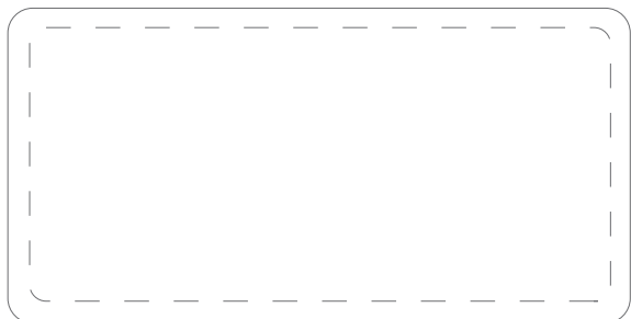
Chalkboard Badge 75 x 38mm Safety area 2,5mm Printable surface 70 x 33mm