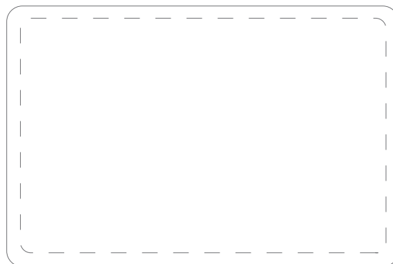
Chalkboard Badge 75 x 50mm Safety area 2,5mm Printable surface 70 x 45mm